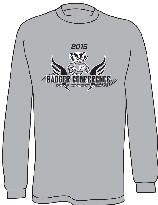
LONG SLEEVE DRI-FIT SHIRT $16 SILVER ADULT S-XXXL

SALESMAN JEFF HOWARD PHONE 1.800.627.6699 FAX 608.274.5322