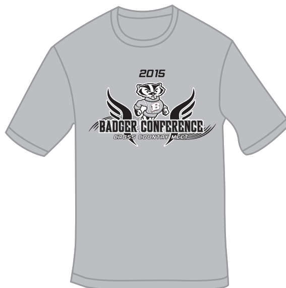
DRI-FIT SHIRT $12 SILVER ADULT S-XXXL

MONONA GROVE MADISON EDGEWOOD OREGON STOUGHTON MILTON MONROE FORT ATKINSON